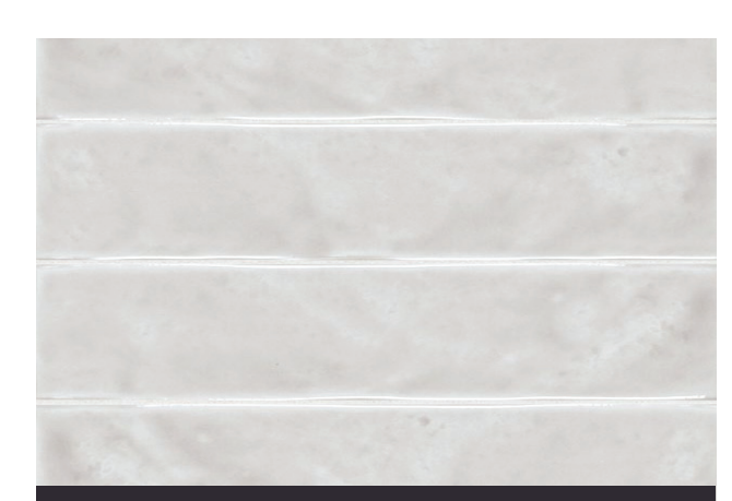
LEVEL 3 KITCHEN BACKSPLASH: MARLOW MIST UPGRADE PACKAGE

LEVEL 1 KITCHEN & VANITY CABINET: SHAKER WHITE UPGRADE PACKAGE