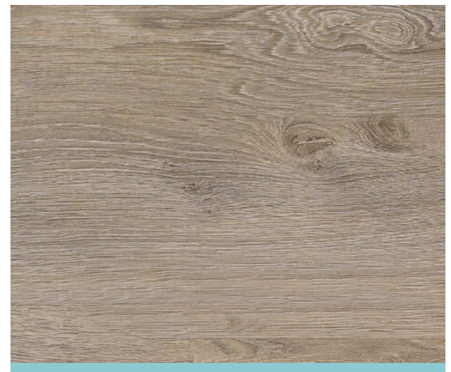
LAMINATE FLOORING: EASTERN BOREAL STANDARD PACKAGE

More finish options are available at our Design Centre. You will be able to choose from a wide variety of options at your Personal Design Appointment after purchasing.