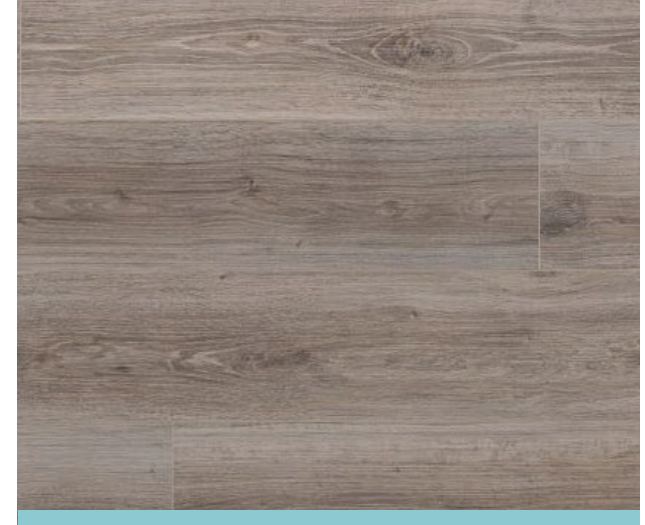
LAMINATE FLOORING: NORTHERN CORDILLERA STANDARD PACKAGE