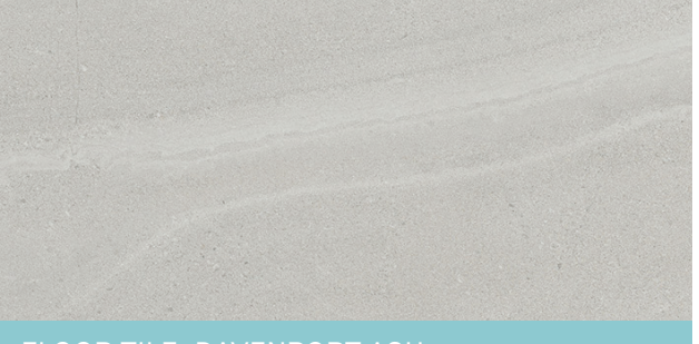
FLOOR TILE: DAVENPORT AS STANDARD PACKAGE

More finish options are available at our Design Centre. You will be able to choose from a wide variety of options at your Personal Design Appointment after purchasing.