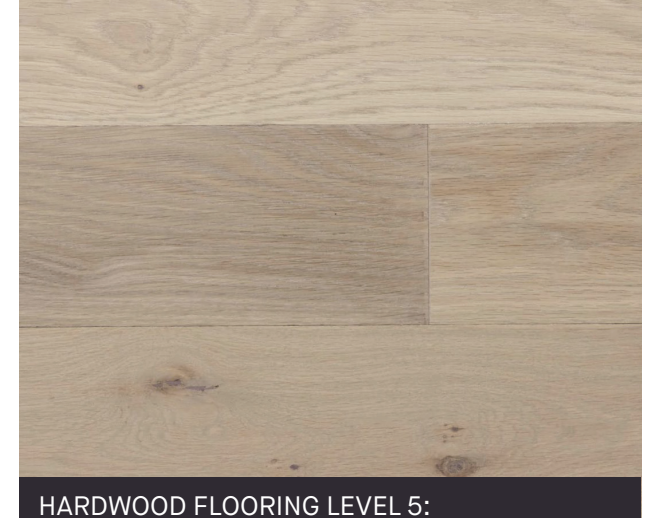
NAUTILUS WHITE OAK 5" UPGRADE PACKAGE

Please contact a Sales Representative to view all finishes.